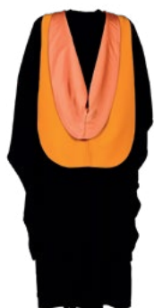
3. Postgraduate diplomas