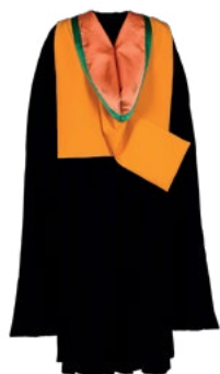
2. Master's degrees