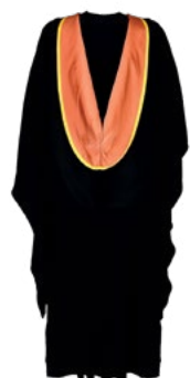
5. Foundation degrees