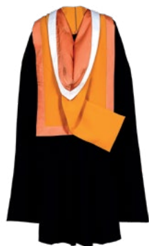
1. PhD degrees