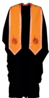
6. DMU licentiateship