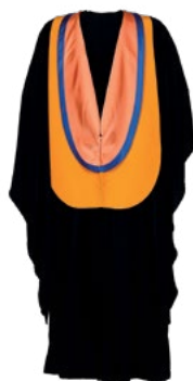
4. Bachelor's degrees