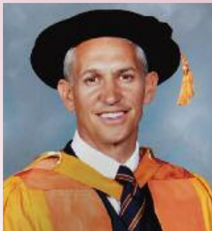
Gary Lineker receives his Honourary degree