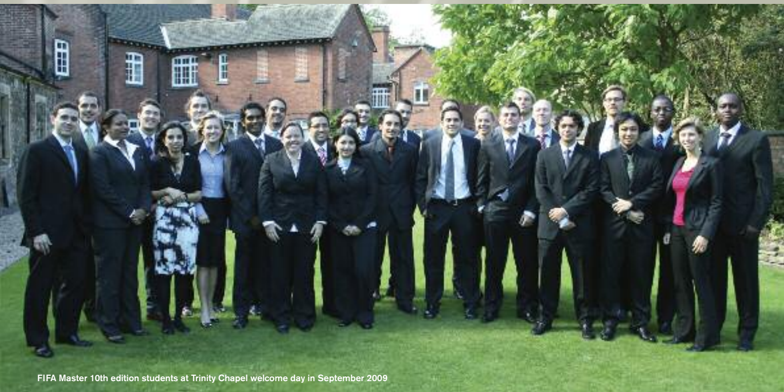
FIFA Master 10th edition students at Trinity Chapel welcome day in September 2009