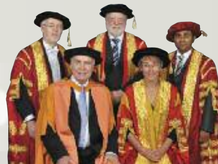
Hugh McIlvanney, (Pictured front row, left)

“I am delighted to receive such an honour. It is a day I'll remember with pride and affection.” Hugh McIlvanney