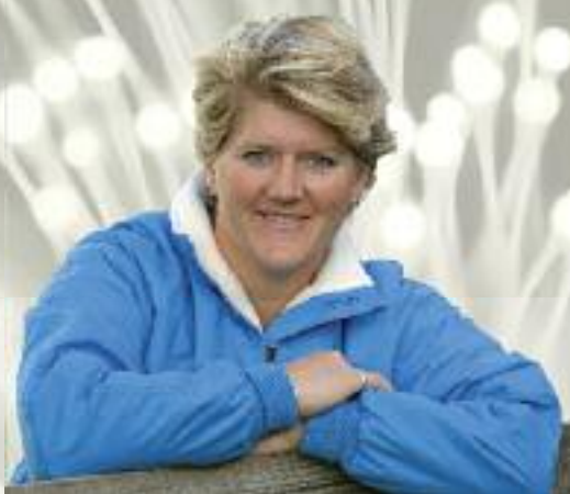
The BBC's Clare Balding will present the series