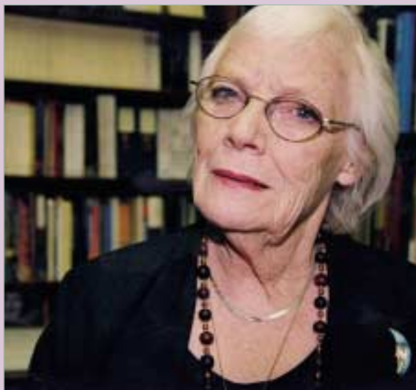
Cicely Berry OBE

Cicely Berry OBE is Voice Director of the Royal Shakespeare Company and a leading international voice teacher and