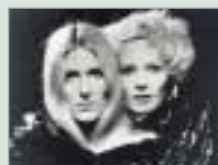
Daughters of Darkness

Harry Kumel will introduce screenings of his films Daughters of Darkness and Malpertuis at Phoenix Arts on the 6th March.